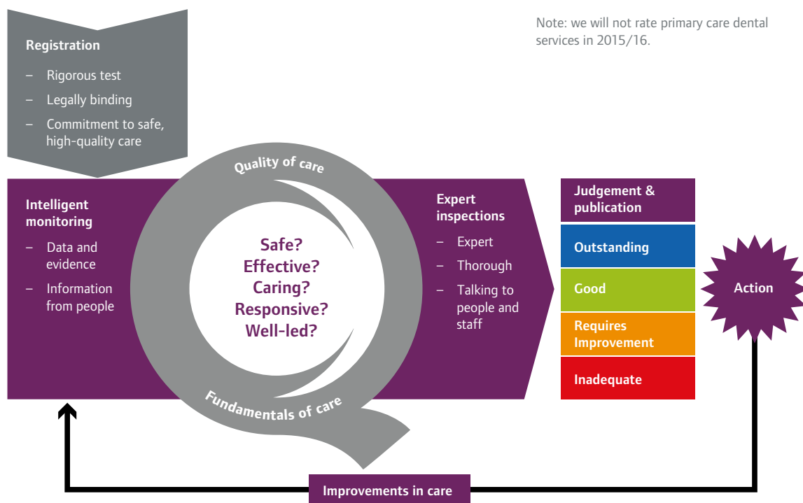
FIGURE 1: OVERVIEW OF CQC'S OPERATING MODEL

There are also community dental services that provide dental treatment for adults and children who cannot be treated in an ordinary general dental practice, as well as specialist dental services provided in hospital settings. These are within the regulatory remit of the Chief Inspector of Hospitals. We are working closely with the Chief Inspector of Hospitals to align our regulatory approach to dental services where they are provided in these settings.